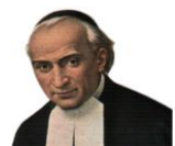
St. Benilde Romancon

Benildeans do ordinary things extraordinarily well.